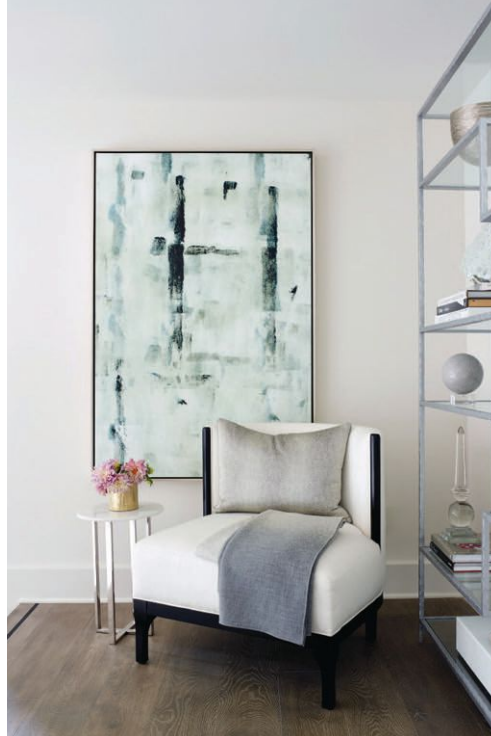
Designers advise homeowners to pick artwork they truly like, and ethereal pieces for rooms where tranquility is key.

Galleries as well as museums can show a client how a work of art, properly displayed, can impact a space and also how it compares with other pieces. Clients may not always want to visit