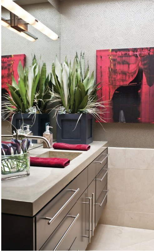
Colorful artwork can enhance a bathroom.

art will think about placement; they want to put it where it can be seen. Significant investment pieces should not end up in the garage or hall closet. ... If it contains a questionable subject or nudity, then the piece is typically put in a bedroom.”