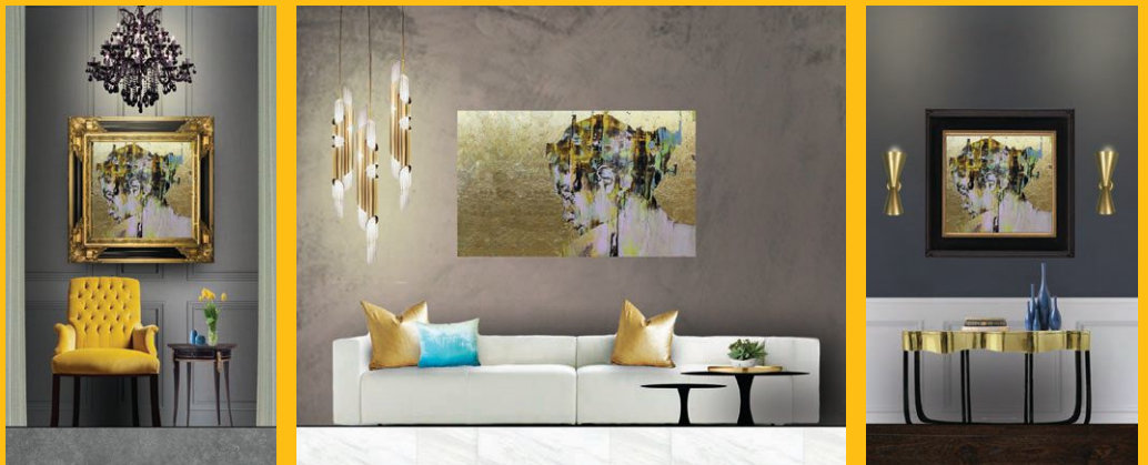
A special exhibit at Laguna Art-A-Fair will show different ways to display a piece of art in the home.

Expect to see the latest design trends in kitchen, flooring, lighting, wall finishes and furnishings, with brands like Bang & Olufsen,